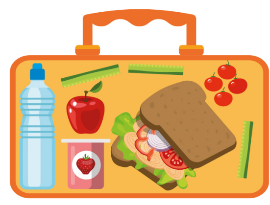
Example of a nutritional packed lunch based on the Eatwell Guide

Choosing nutritional food for a packed lunch can be tricky, especially because processed food and snacks can contain lots of fat and sugar. Choosing a variety of foods from the Eatwell Guide can help to make packed lunches healthier.