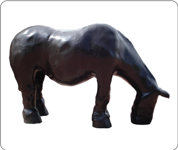
Untitled (Horse on Square) by Tom Claassen, 1996