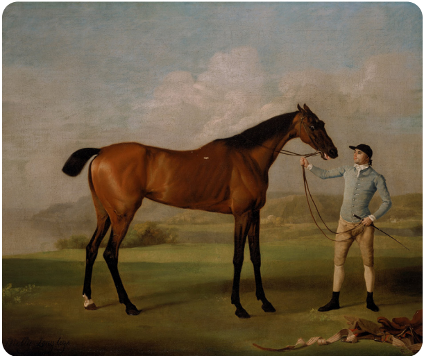
Molly Long-legs with her Jockey by George Stubbs, 1762